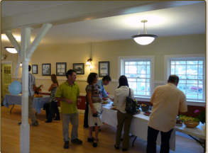
Montclair Civic Building aka “The Molkery”