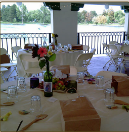
Washington Park Boathouse.

For more information or to book any one of these historic venues, call 720.913.0766 or visit www.denvergov.org/meetingfacilities .